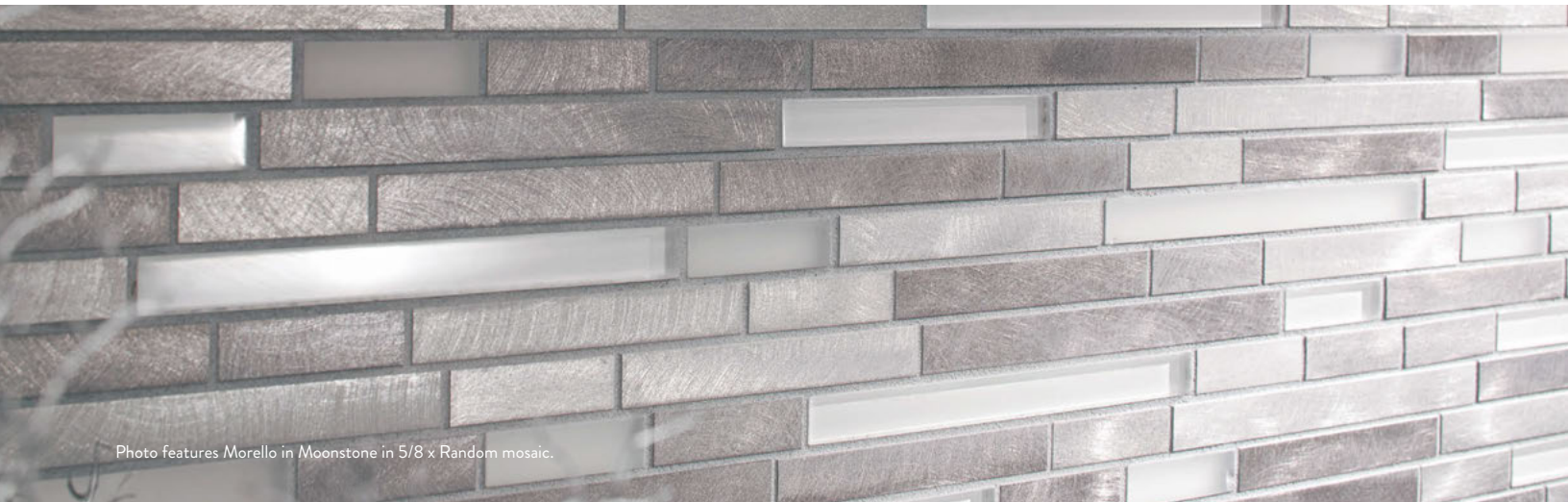
Photo features Morello in Moonstone in 5/8 x Random mosaic.